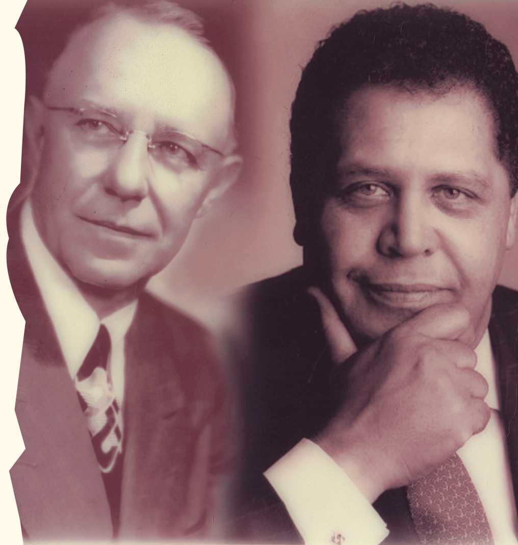
Mayor William B. Hartsfield